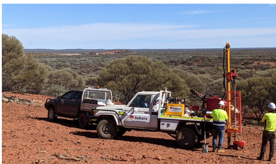
Figure 1 – Auger rig at Central Sandstone Project with mill in background

All samples have been dispatched to the laboratory and the company expects results to be returned in 2-3 weeks.